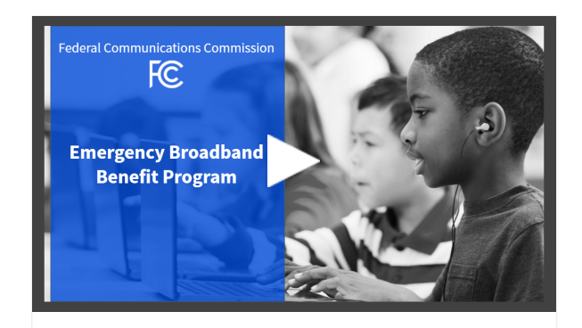
What is the Emergency Broadband Benefit Program?

The Emergency Broadband Benefit Program is administered by USAC with oversight from the Federal Communications Commission (FCC).